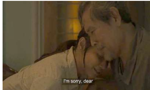
Figure 9. Scene 9

Next is the scene 9 analysis table about Kaluna’s dad apologizing to her.