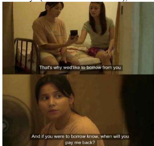
Figure 3. Scene 3

Next is the scene 3 analysis table about Natya (Kaluna's sister-in-law), who wants to borrow money from Kaluna.