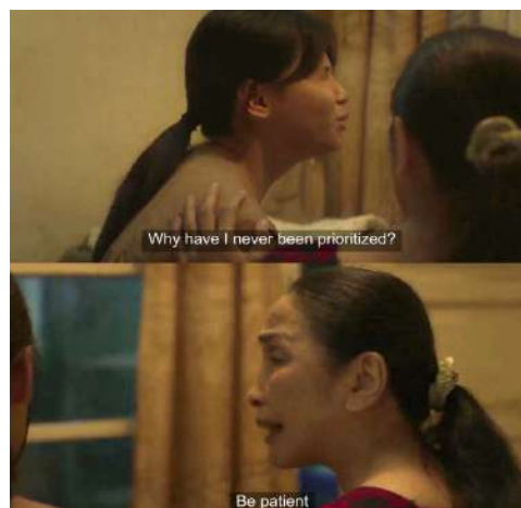
Figure 2. Scene 2

Next, the scene 2 analysis table about Kaluna's room being moved to the maid's room.