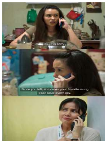
Figure 8. Scene 8

Next is the scene 8 analysis table about Kamala calling Kaluna to apologize and ask Kaluna to go home.