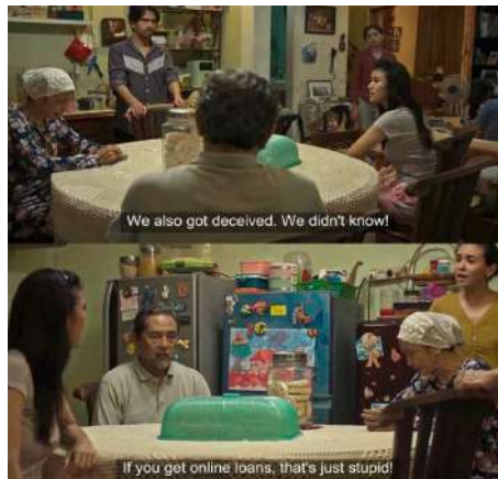
Figure 5. Scene 5

Next is the scene 5 analysis table about the Kaluna family feud at the dinner table due to Kanendra being involved in pinjol (online loans).