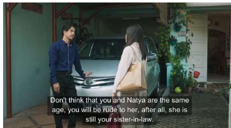
Figure 4. Scene 4

Next is the scene 4 analysis table about Kaluna who was reprimanded by Kanendra because of his conversation yesterday with Natya.