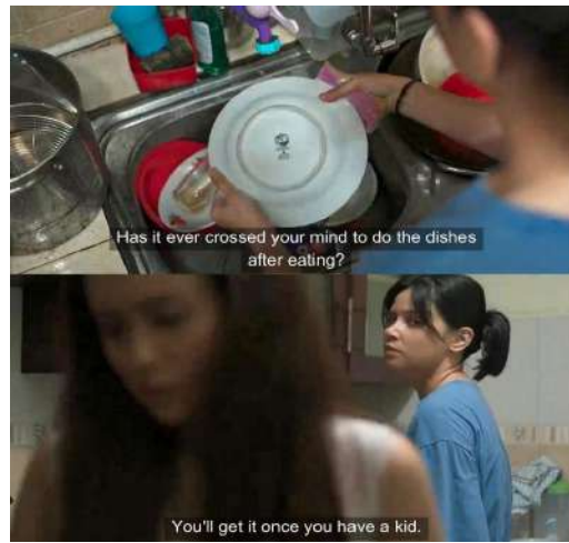
Figure 1. Scene 1

Based on the research results, there are 10 scenes in the movie Home Sweet Loan that show family communication is a sign that has Object and Interpretant, so that it describes the communication process, among others, as follows: