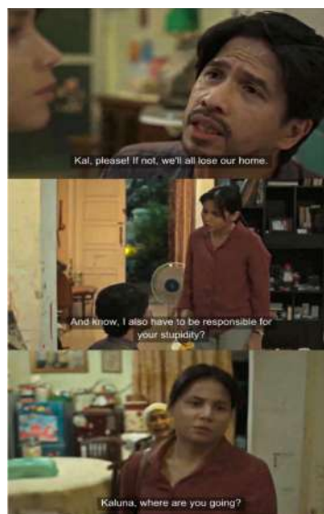
Figure 6. Scene 6

Next is the scene 6 analysis table about Kanendra who wants to borrow Kaluna's money to pay off his online loan debt.