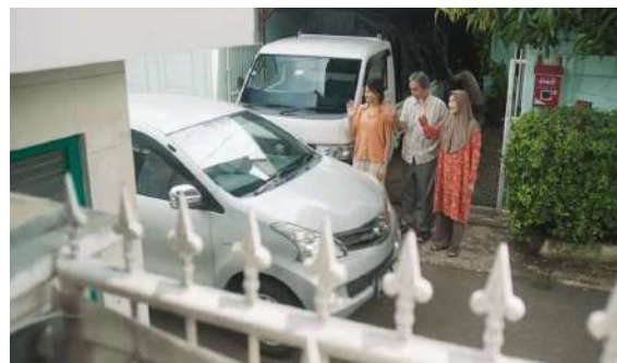
Figure 10. Scene 10

Next is the scene 10 analysis table about Kaluna's father finally selling his grandfather's house, then they choose their own place to live.