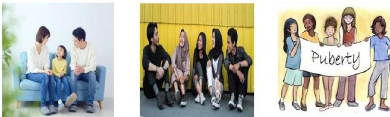
Figure 2: Pictures for Background knowledge activation

The images above assess pupils' prior understanding of the story's topic. Students become acquainted with the topics in the novel and develop a connection to a real-life problem. This project intends to give students a forum to share their teenage experiences. However, more than simply showing the corresponding images is required to urge students to connect with their reality. Thus, the lecturer encouraged questions to assist them in comparing the issues in the story with truth, particularly in Indonesia. The questions were discussed during the perception in each meeting before the text structure and critical analysis discussion. It is meant to focus students' attention on the topic of discussion before moving on to the primary debate. The students' horizons should be broadened before proceeding to the main discussion.