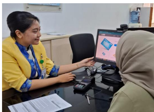
Figure 2. Customer Guidance at PT. Bank Central Asia

During the internship at PT. Bank Central Asia Tbk KCP Burangrang Bandung, the role primarily focused on the Customer Service Officer (CSO) division. This division plays a crucial role in daily operations, directly engaging with customers to fulfill their banking needs and ensure satisfaction. The internship began with familiarization with the CSO counter setup, including E-Service machines and other necessary tools, to facilitate smooth customer interactions. This initial phase underscored the importance of preparation in delivering efficient service.