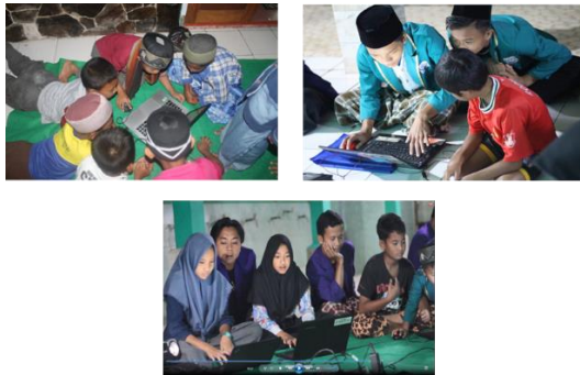
Figure 3. Educational activities

This youth activity was held on January 25 and February 1, 2019. This activity aims to strengthen the talisilaturahmi and strengthen faith and religion. In this youth activity there are usually events such as recitations, prayers, and lectures from religious teachers or local community leaders. This teaching activity was delivered to local youth and carried out for 3 nights. Material delivered and taught to teenage friends about technology between Microsoft Word, Microsoft Power Point, and photo editing. Local teenagers are very enthusiastic about this teaching activity because they are rarely on school benches getting material about computers. This teaching activity was carried out on January 26,27,28 and 2,3 February 2019. This activity aims to provide insights about computers. Because seeing the lack of learning about technology obtained by local teenagers in their school. At the same time providing provisions and understanding for friends when entering the workforce. Educational activities carried out can be seen in the figure 3. Level of acceptance of participant material can be seen in table 1.