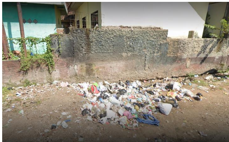
Figure 1. The road ahead of SDN Godog 1-2

Based on the results of interviews with the principal of SDN Godog 1-2 which was carried out on October 5, there were 352 students consisting of grades one to six each, there were 2 classes, namely class A and B who still did not understand about waste management and disposing of garbage. without sorting it out first. The lack of a caring attitude towards the environment and ignoring the garbage that is scattered around the road near the school makes garbage pile up without a container to hold the garbage. Pedestrians or motorcyclists are often seen throwing their trash on the road carelessly (see Figure 1).