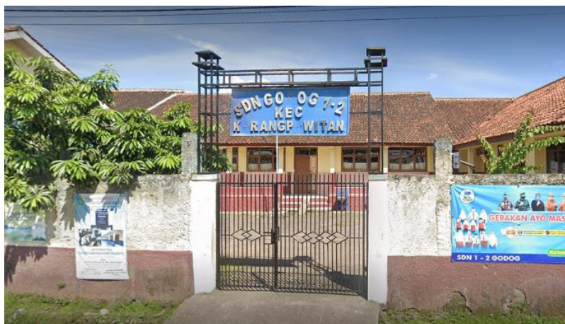
Figure 2. SDN Godog 1 – 2

This community service will be held on October 8, 2021 at SD Negeri Godog 1-2 which is located on Jl. Ahmad Yani Timur, Karangmulya, Kec. Karangpawitan, Garut Regency, West Java, Indonesia (See Figure 2), with a target program of 92 children from grades 4 to 6.