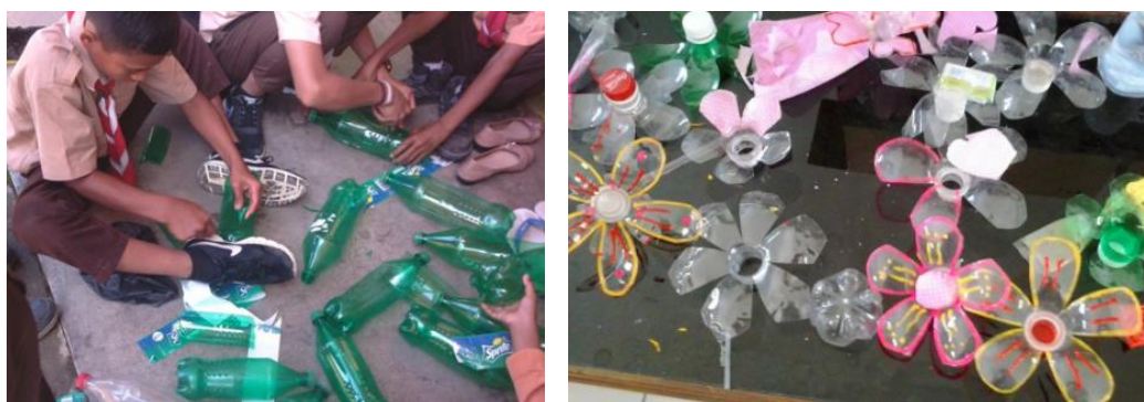
Figure 3. The participants' practice of making art from trash

Students are also given an understanding to always use environmentally friendly materials compared to using plastic. Because plastic is a material that is difficult to decompose and becomes a big problem because it is cheap and easy to get, so plastic waste is very much found around schools. They are also encouraged to bring their own drinking supplies from home, this is an action that can reduce the waste of used drinking bottles that they buy every day. After the material was finished, they continued with making creations using used bottles that they had brought home before. The participants' practice of making art from trash can be seen in Figure 3.